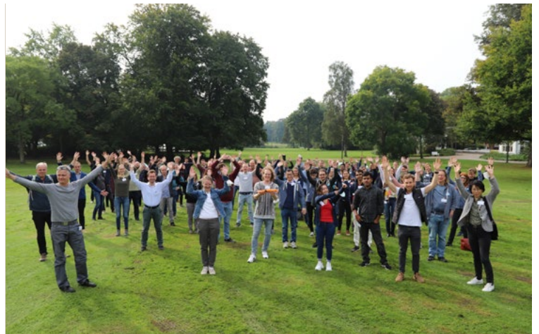
Retreat: Happy to be able to meet in person again!