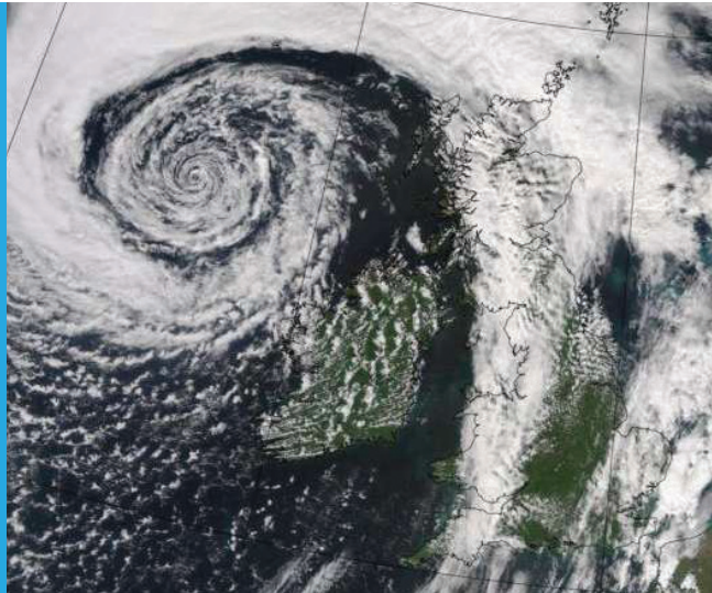
↑ Atmospheric storm over Europe

They are also known as the “weather” of the ocean. They can be compared to highs and lows on weather maps, but are substantially smaller than their atmospheric counterparts.