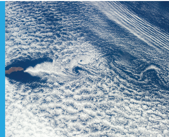
↑ Signature of a small eddy and gravity waves seen in clouds in the atmosphere